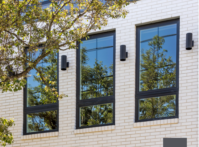
Battle Creek (Soldier Course & Rowlock)